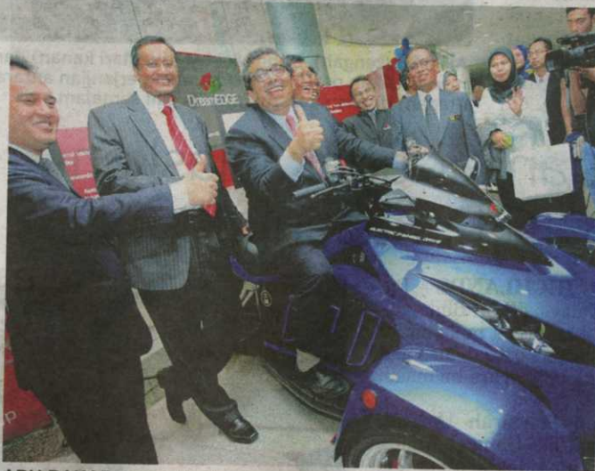
ABU BAKAR mencuba kenderaan beroda tiga yang menggunakan tenaga elektrik sepenuhnya selepas merasmikan program IVM di Kuala Lumpur semalam.

"Inisiatif TPM dengan menghasilkan model perniagaan yang pertama di Malaysia menghubungkan kerjasama strategik perkhidmatan maya untuk usahawan teknologi mendapatkan bimbingan daripada inkubator tan-